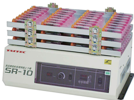
SR-10 with 2-tier platform

A few Centrifuge tubes are shaken horizontally. --> P.054 A few Centrifuge tubes are stirred intensely. --> P.056